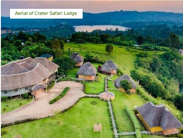
Aerial of Crater Safari Lodge

When you stay at Crater Safari Lodge just inside Kibale National Park, you're in a good location for seeing all that the area has to offer. Facilities here include A swimming pool, a wildlife viewing deck and a bar.