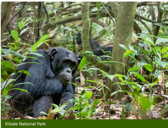
Kibale National Park

You'll see a very different side of the African bush on a night drive. Away from the city lights, the night sky glitters overhead, while your guide will use a spotlight to pick out the reflective eyes of nocturnal creatures such as leopard, genet, porcupine, bushbaby and owl.