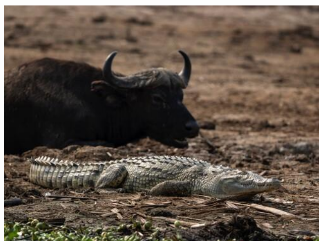
Murchison Falls National Park