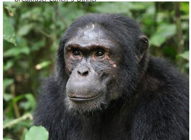
Kibale National Park