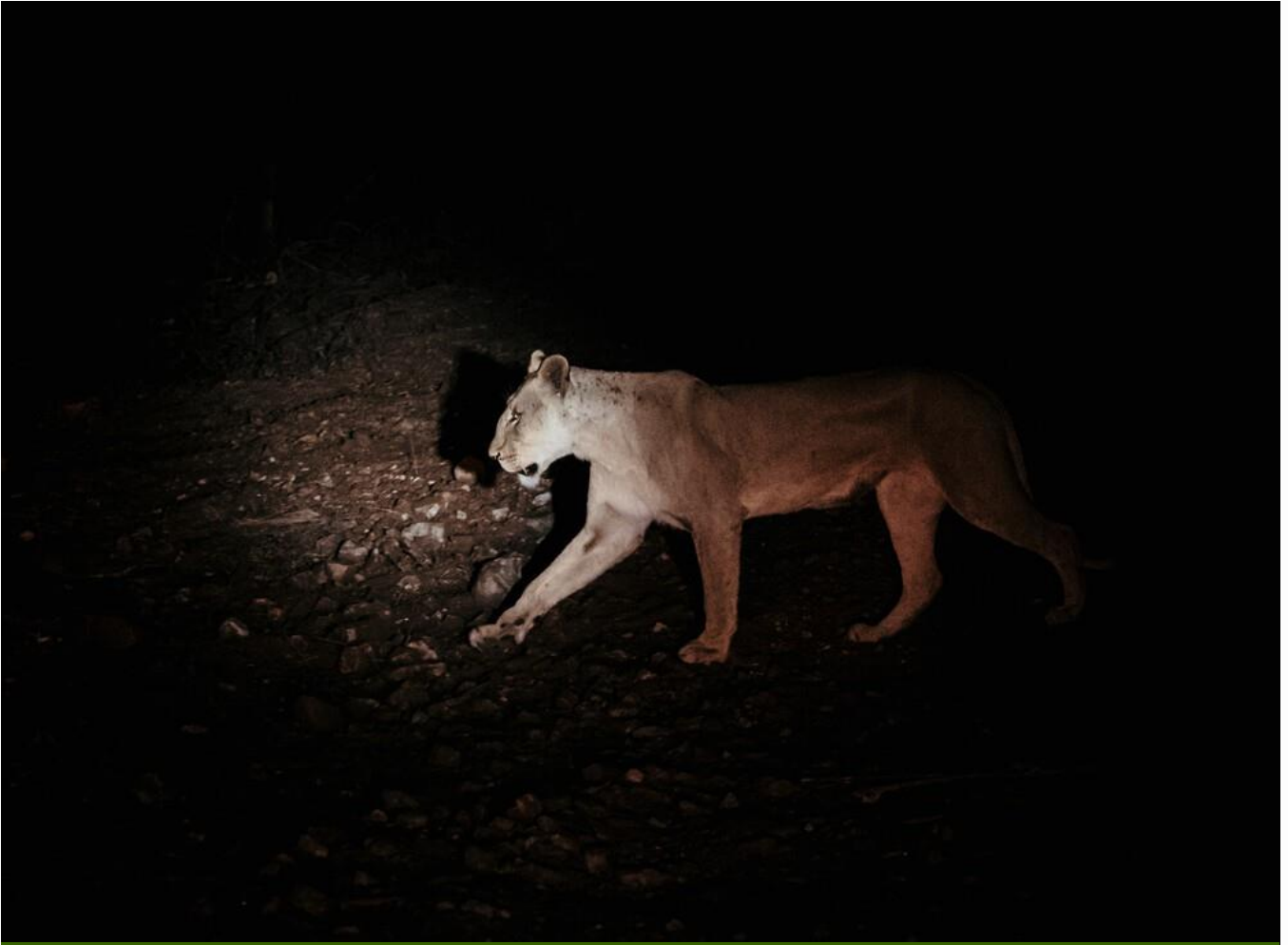
Night Game Drive