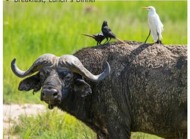
Murchison Falls National Park