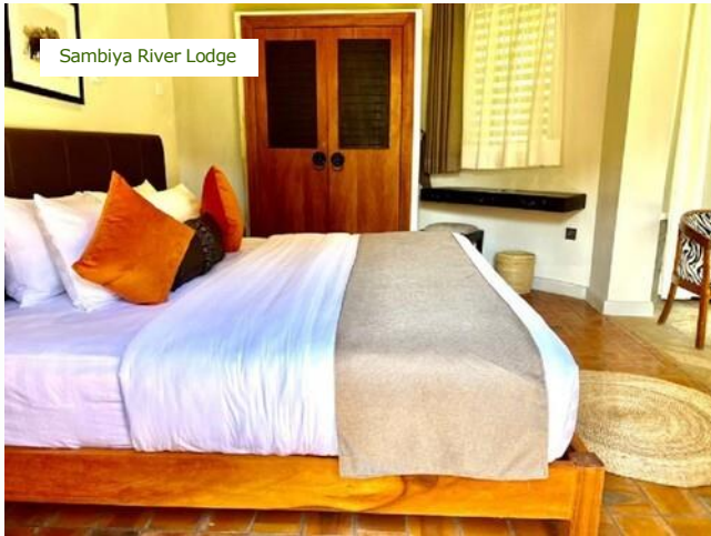
Sambiya River Lodge

Spend another night in Sambiya River Lodge.