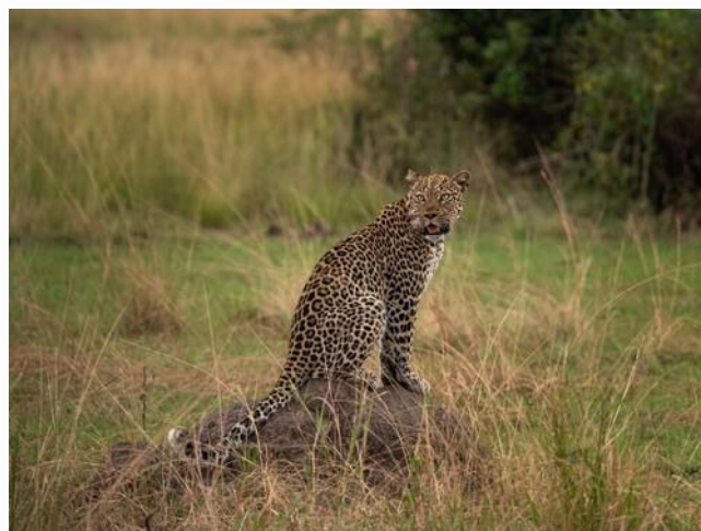
Queen Elizabeth National Park