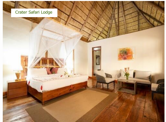
Crater Safari Lodge