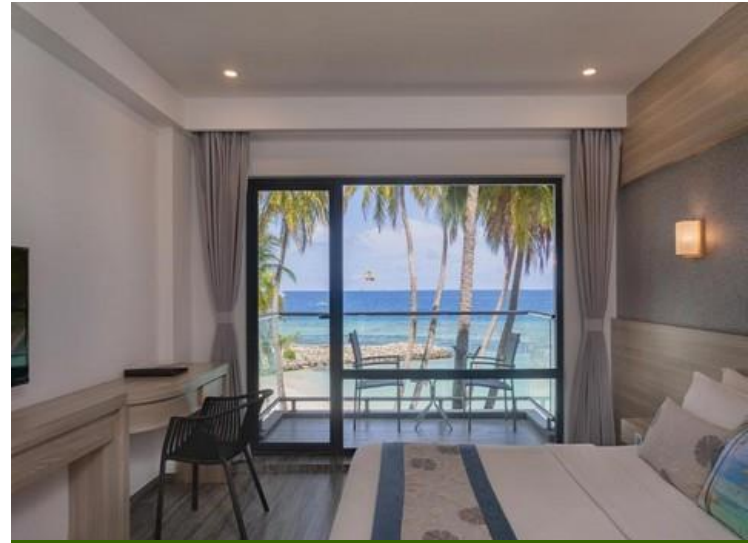
KAANI GRAND SEA VIEW