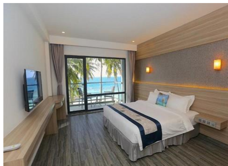
KAANI GRAND SEA VIEW