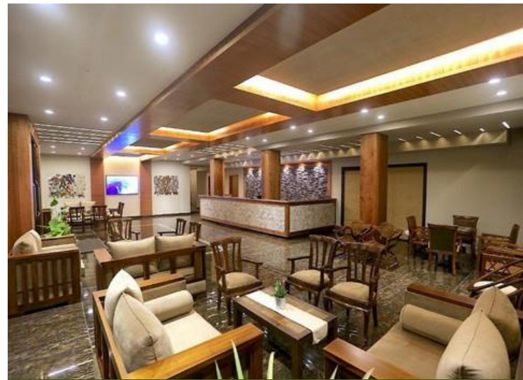
KAANI GRAND SEA VIEW