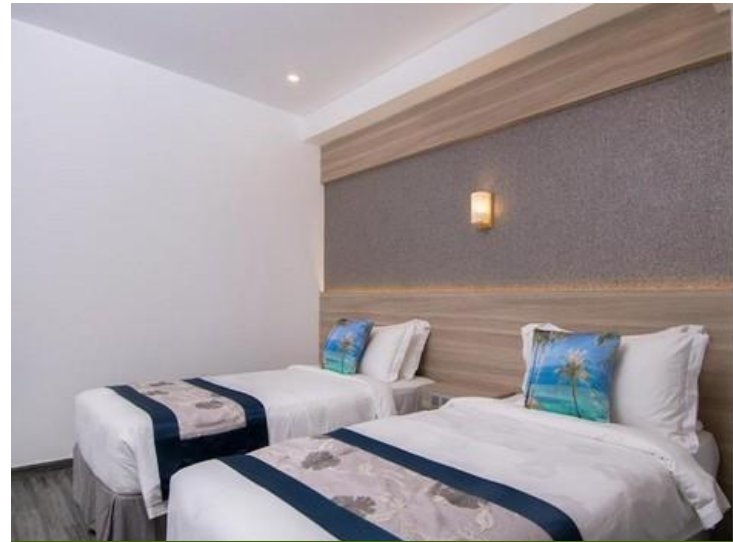
KAANI GRAND SEA VIEW