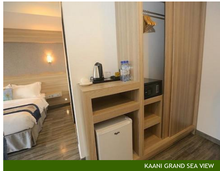
KAANI GRAND SEA VIEW