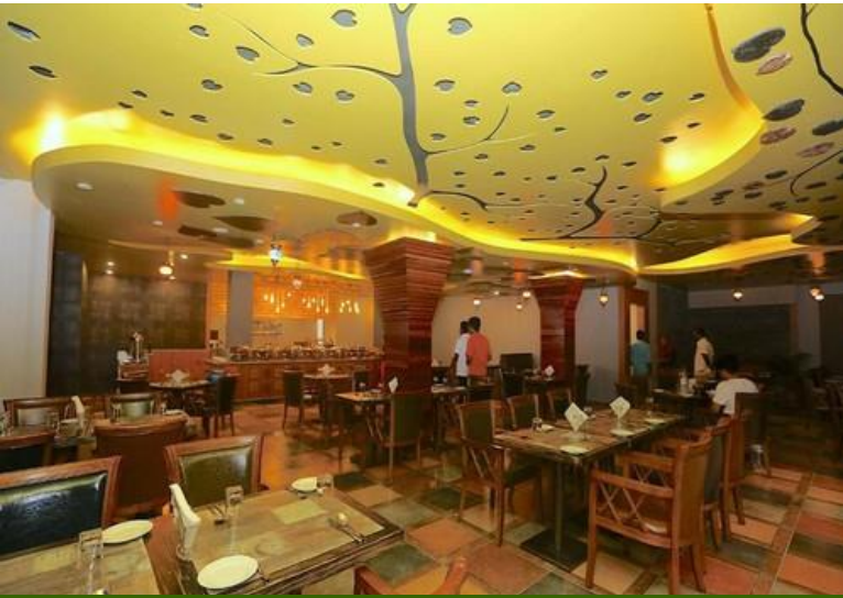
KAANI GRAND SEA VIEW