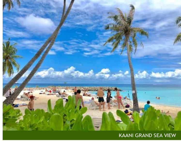
KAANI GRAND SEA VIEW