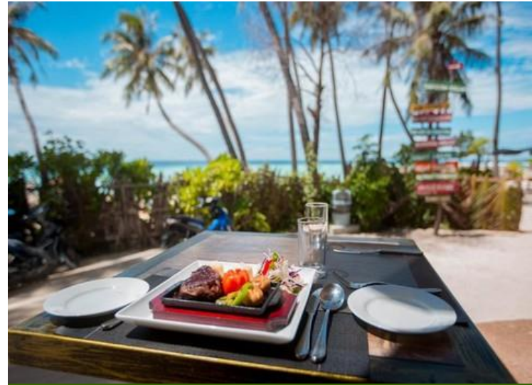
KAANI GRAND SEA VIEW