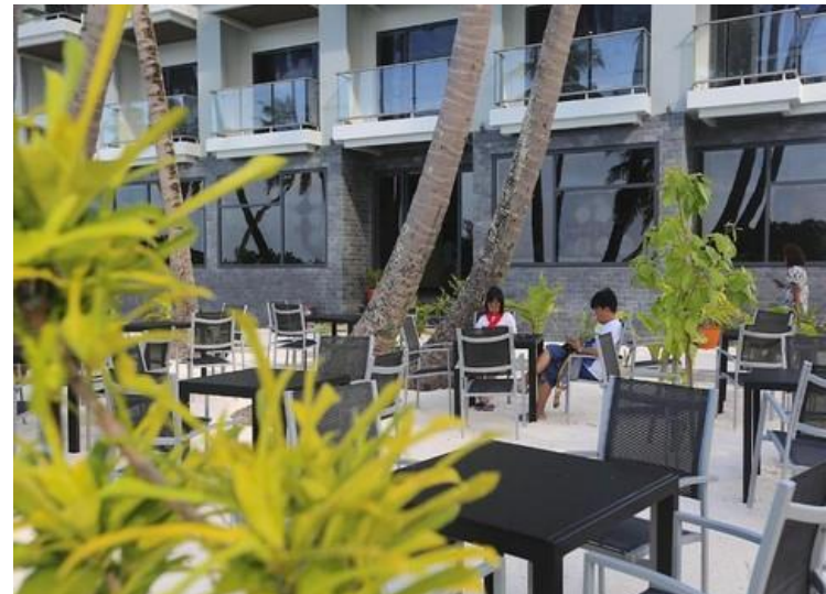
KAANI GRAND SEA VIEW