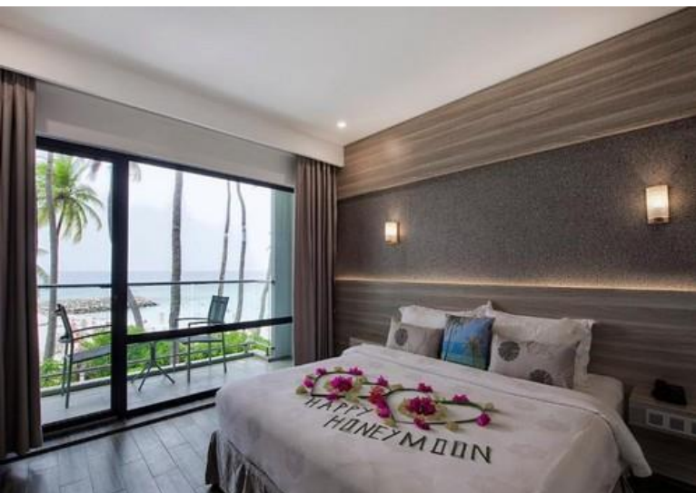
KAANI GRAND SEA VIEW