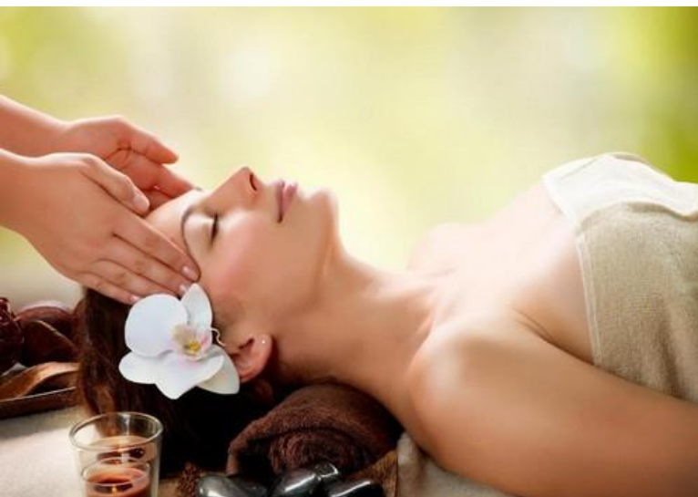
KAANI GRAND SEA VIEW