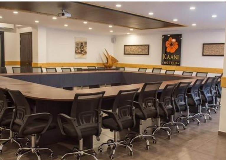
KAANI GRAND SEA VIEW