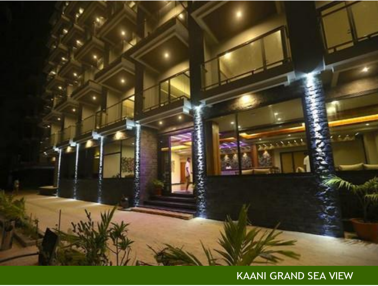
KAANI GRAND SEA VIEW

Enjoy staying at KAANI GRAND SEA VIEW as your base while you're here.