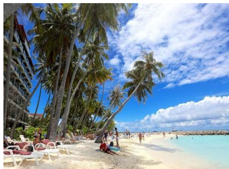
KAANI GRAND SEA VIEW