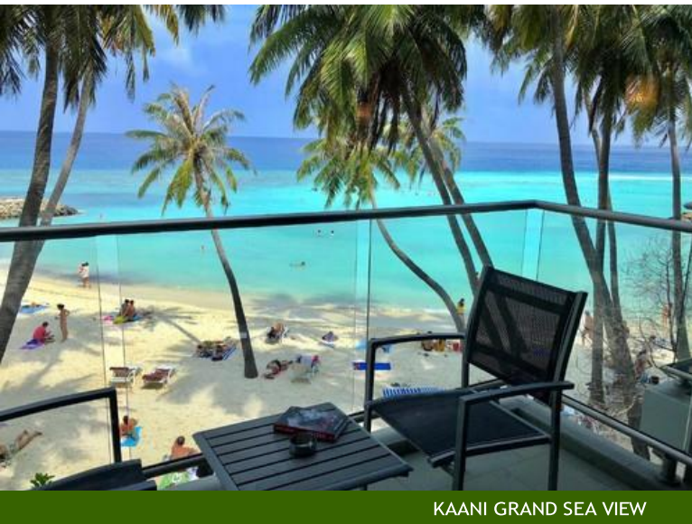
KAANI GRAND SEA VIEW