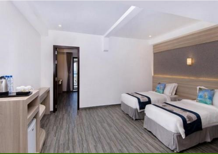
KAANI GRAND SEA VIEW