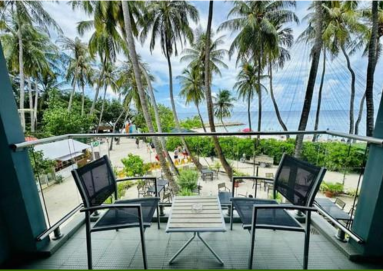
KAANI GRAND SEA VIEW

You'll stay with us at KAANI GRAND SEA VIEW.