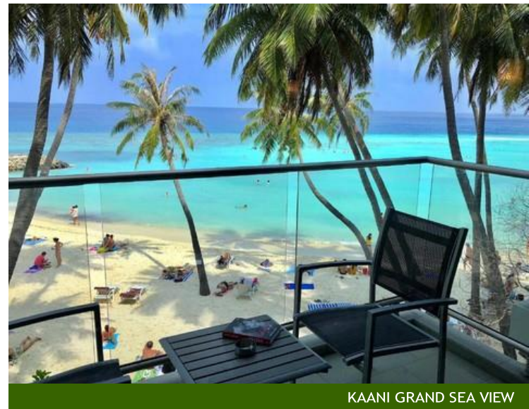
KAANI GRAND SEA VIEW